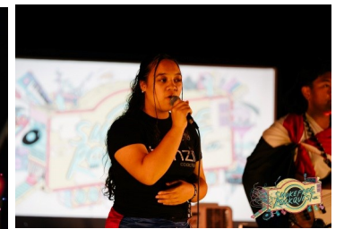
The Lil’ Saints

Congratulations to all three bands who competed in the Smokefree Rockquest regional heats. Lil’ Saints won the Tangata Beats section of the regional heat, with all three going through to the finals.