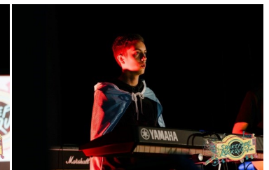
Pinoy Band (below)