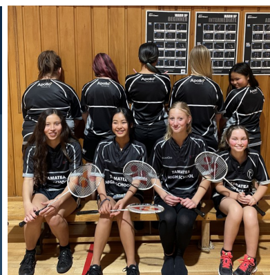
Girls' Badminton — thanks to Apollo for our Badminton gear