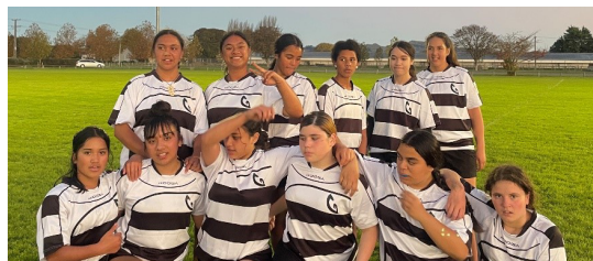
Ahuriri Girls' Rugby