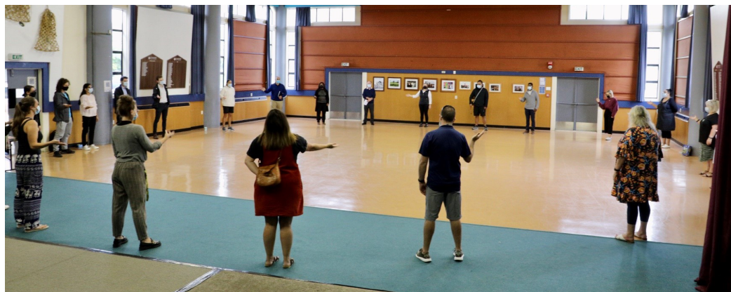
Morning briefings are not quite the same during Covid, space and masks are necessary.