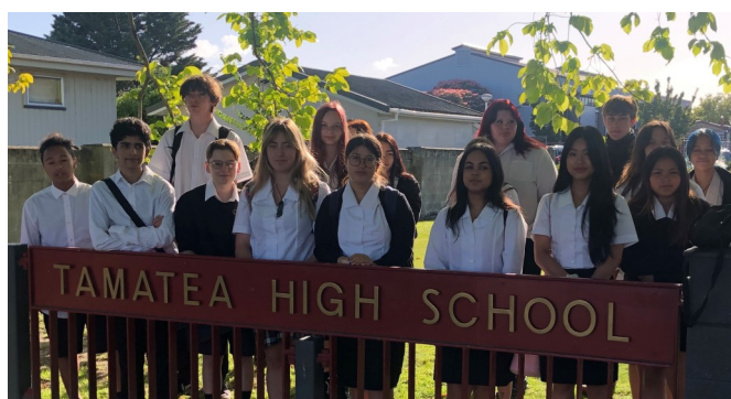
Trades Academy at EIT Te Pūkenga started on 10 February; these are some of the students attending Trades Academy this year.